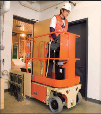
Five-inch turning radius and narrow profile provides more maneuverability.