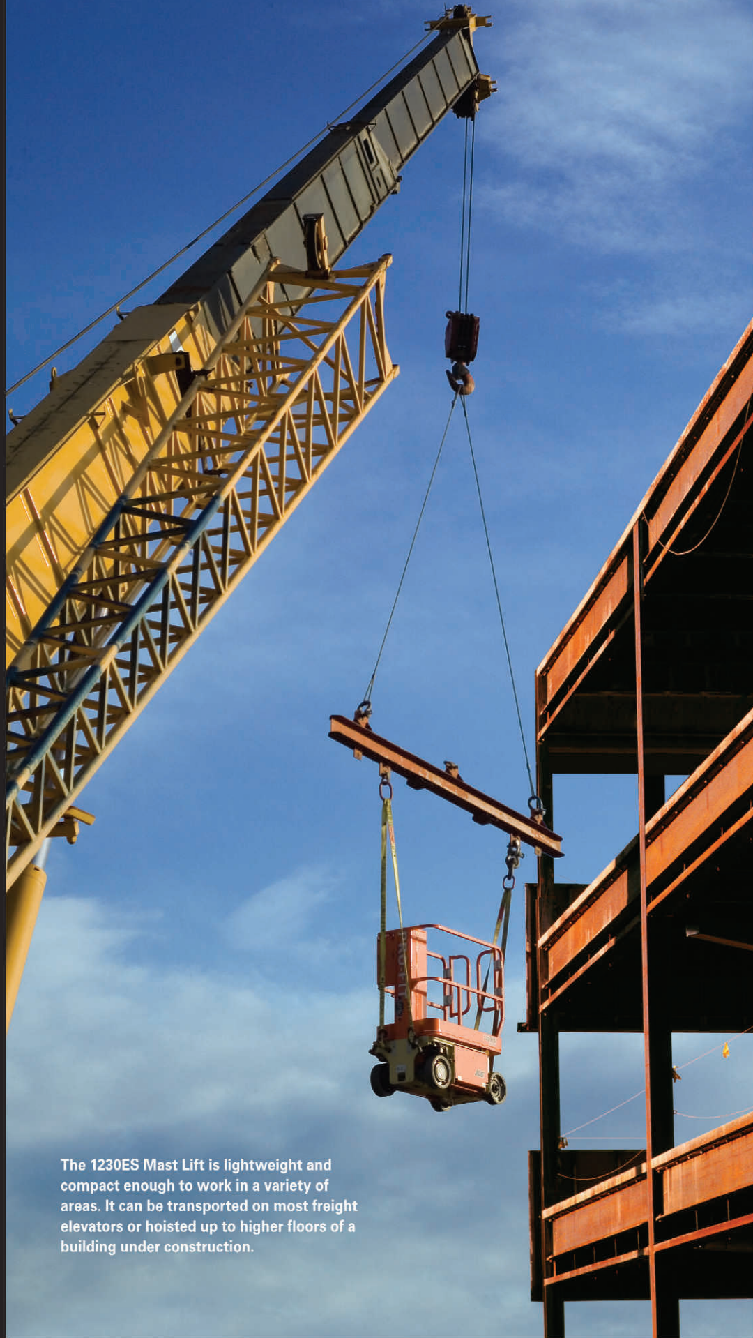
The 1230ES Mast Lift is lightweight and compact enough to work in a variety of areas. It can be transported on most freight elevators or hoisted up to higher floors of a building under construction.