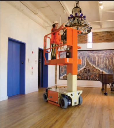
Low overall weight. For use on mezzanine or sensitive floors.