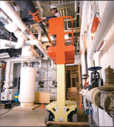
The 27.5" x 40" (interior) platform can hold up to 500 lb.